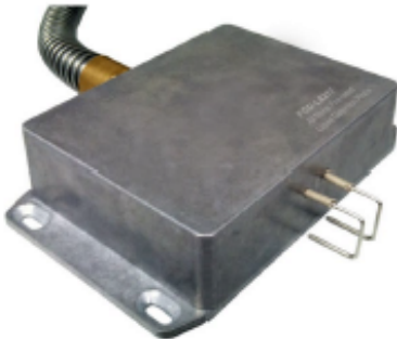
The diagram below shown a typical system configurations when using AQM-W217: